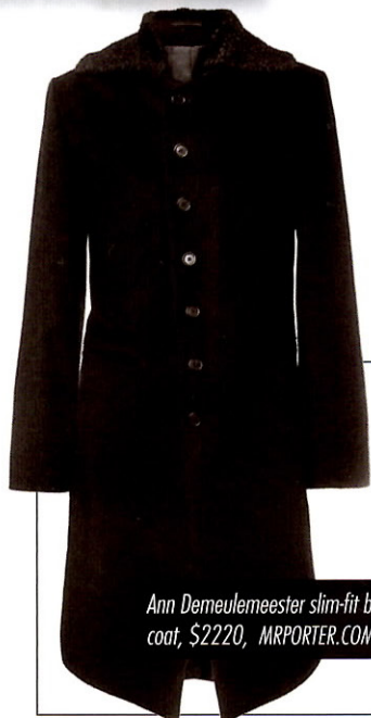
Ann Demeulemeester slim-fit brushed coat, $2220, MRPORTER.COM

"Amazing caged citrine. Very unique design and a fabulous way to wear precious stones."