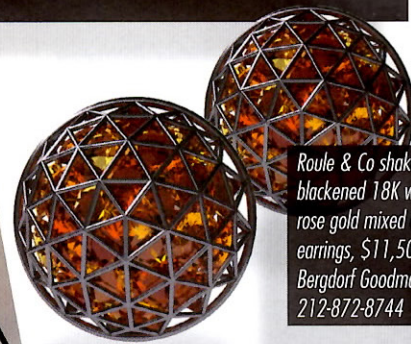
Roule & Co shaker dome blackened 18K white and rose gold mixed citrine earrings, $11,500, Bergdorf Goodman, NY, 212-872-8744

"Femininity with an edge. A classic sheath updated with leather detailing."