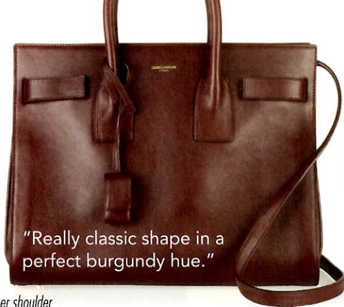
Saint Laurent Sac Du Jour leather tote, $2950, NET-A-PORTER.COM

"Really classic shape in a perfect burgundy hue."