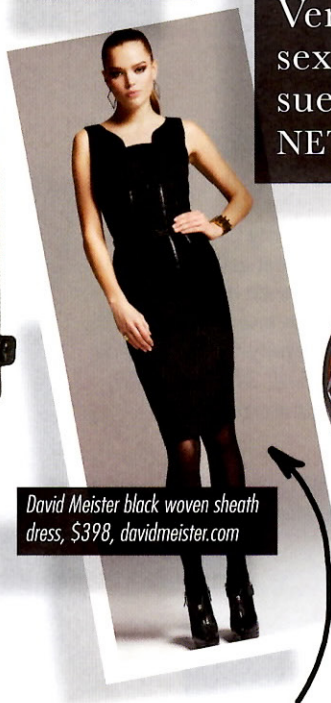
David Meister black woven sheath dress, $398, davidmeister.com

"Femininity with an edge. A classic sheath updated with leather detailing."