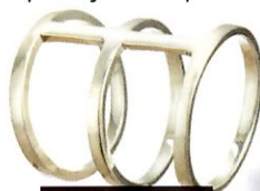
Loren Stewart silver three-bar cuff ring, $195, barneys.com

"I love this ring—very graphic yet simple."