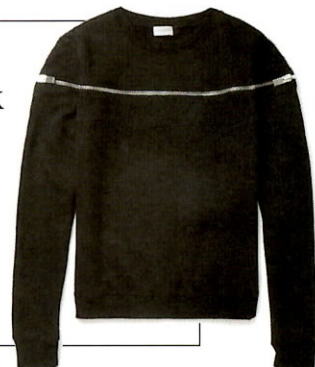
Saint Laurent zipped cotton jersey sweatshirt, $690, MRPORTER.COM